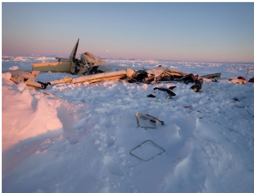
Figure 1. Accident site.

The airplane came to rest upright. The propeller assembly separated from the engine and was located adjacent to the wreckage. The engine cowling was dislocated and fragmented. The engine remained secured to the mount; however, both the engine assembly and the mount were damaged consistent with impact forces. The fuselage exhibited upward crushing damage along the entire length. Both wings were damaged, with the left wing being partially separated from the fuselage. Both wings exhibited leading-edge crushing damage along the entire spans. The outboard portion of the right wing was rotated aft and partially separated. An initial airframe examination revealed no evidence of an in-flight structural failure.