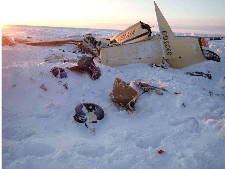
Figure 2. Accident site.

Minor ice accumulation was observed on the leading-edge surfaces aft of the TKS porous membranes. Significant ice accumulation was observed on the base of the beacon/strobe light located at the top of the vertical stabilizer. A dusting of blown snow had accumulated on the airplane after the accident.