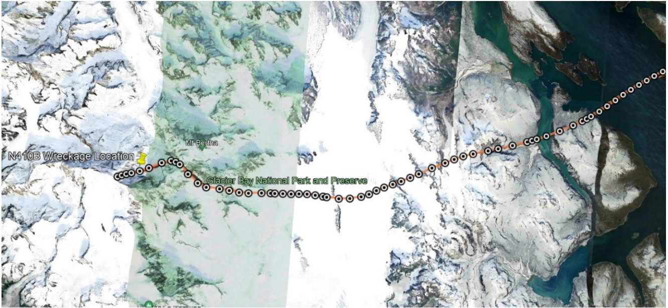
Figure 1: Accident airplane’s ADS-B track through Glacier Bay National Park

About 1421, as the airplane’s flight track continued along a westerly heading of 245°, at an altitude of 10,875 ft. above mean sea level (MSL), and with a groundspeed of 141 kts, the flight track abruptly stops on the eastern side of East Crillon mountain. The elevation of the terrain above the last data point is about 11,220 ft MSL. The down sloping terrain on the eastern side of East Crillon mountain consists of expansive vertical rock and snow-covered terrain, hanging glaciers, with areas of widespread glacial crevasses directly below. (See Figure 2)