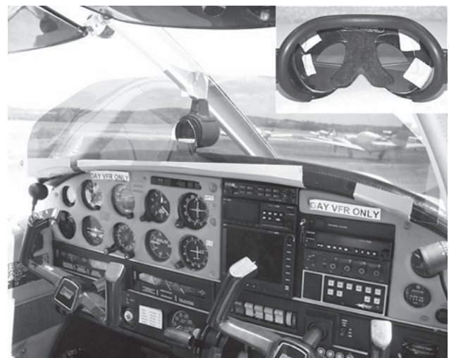
Figure 3. Polaroid material across windscreen of Piper Archer with (inset) Francis hood.

Data recording. Several forms of data were recorded for each flight. Flight performance data were recorded via a Cambridge Aero Instruments GPS Navigator and Secure Flight Recorder. This generated a plan-view map and vertical-profile view of the flight path for the purpose of assessing average and maximum flight-path deviations. A color digital video recording was also obtained during the flight with audio of all intercom/radio communications. The field of view of the camera, which was attached to the cabin headliner